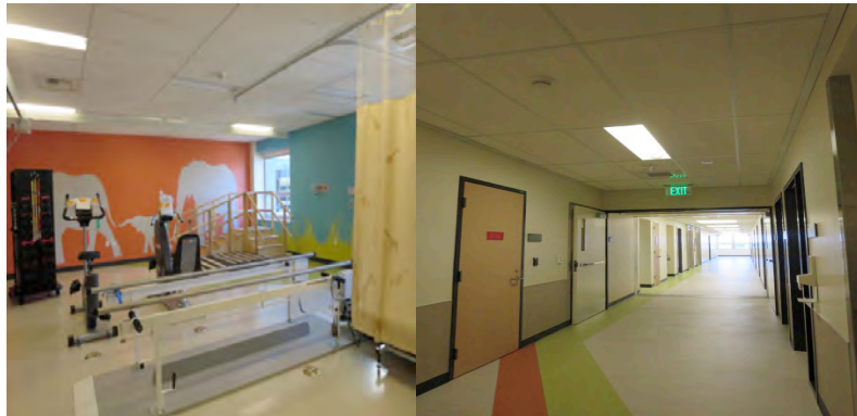
New Rehabilitation Room

4650 Sunset Boulevard, Los Angeles CA 90027 (323) 361-2367